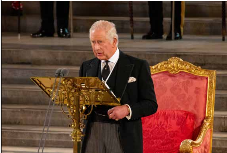
King Charles III, 2022